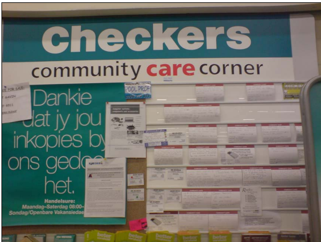
Figure 7-2: Site Notice on the community board at the Checkers at Burgundy Estate.